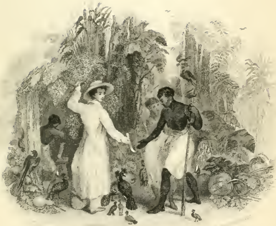
THE LADY AND THE NEGRO. (From the "Gleaner," 1857.)